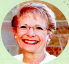
ProLife Across America