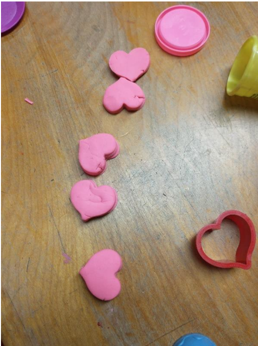
Valentine's Greetings from our Listeners students (Age 3 to Grade 1)

Have a heart for children? We're looking to expand our list of teachers, classroom helpers, and substitutes! Lessons and supplies are provided and prepared for the teachers. Classroom helpers serve as an extra set of hands and listening ears, especially with our younger students. We'd love to have you view a class and see how you can be part of growing the faith and community of our youngest congregation members!